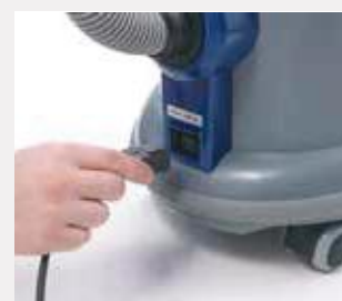
Socket for power brush