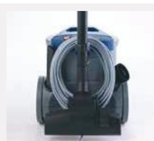
New fixing system