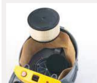
Motor protection filter + cartridge filter